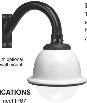
Shown with optional WM20G wall mount